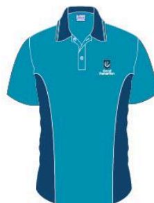
The new sports top for wear only on sports days