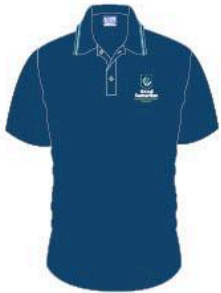
The new polo top for daily wear

Children in Years 1 - 6 may still wear the white polo top and /or sport tops until such time they purchase the new style.